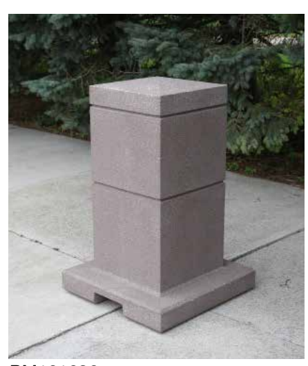
BM161636 Shown in Kahlua light sandblast finish