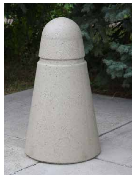
B122442 Bollard Shown in SB9 light sandblast finish.