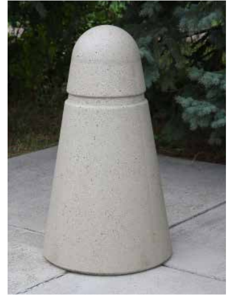
B122442 Bollard Shown in SB9 light sandblast finish.

Size: 12" Top Dia. 24" Bottom Dia. x Height: 42" Weight: 855 lbs.